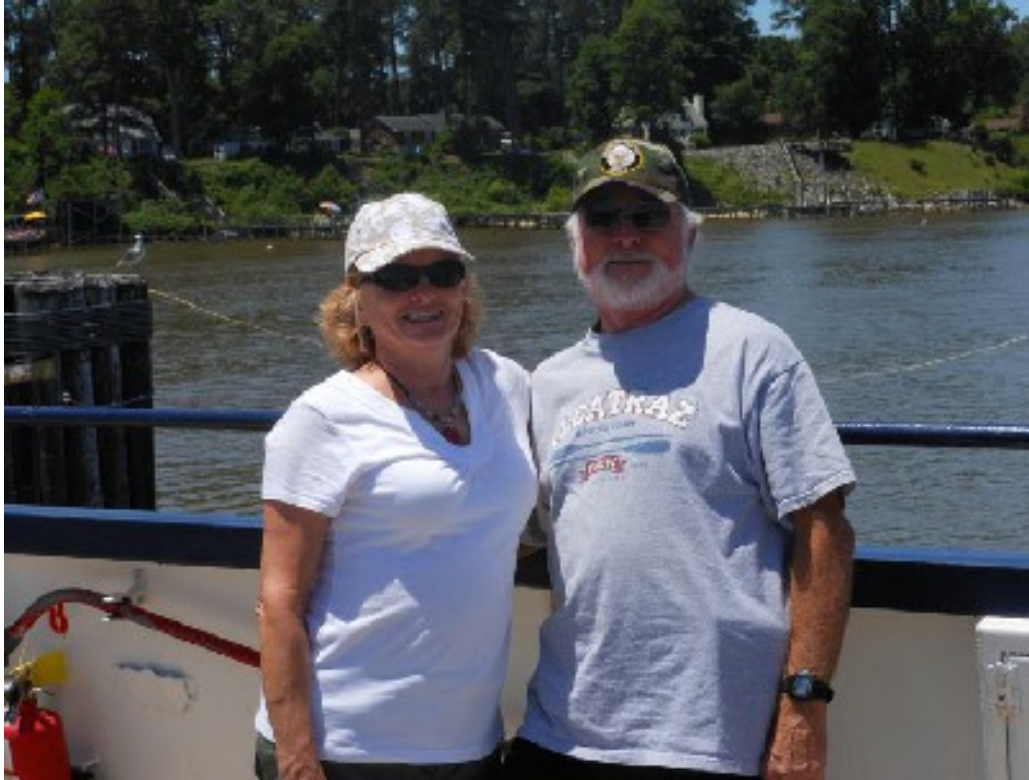
Photo taken on a ferry near Jamestown, VA. We miss y'all . . .